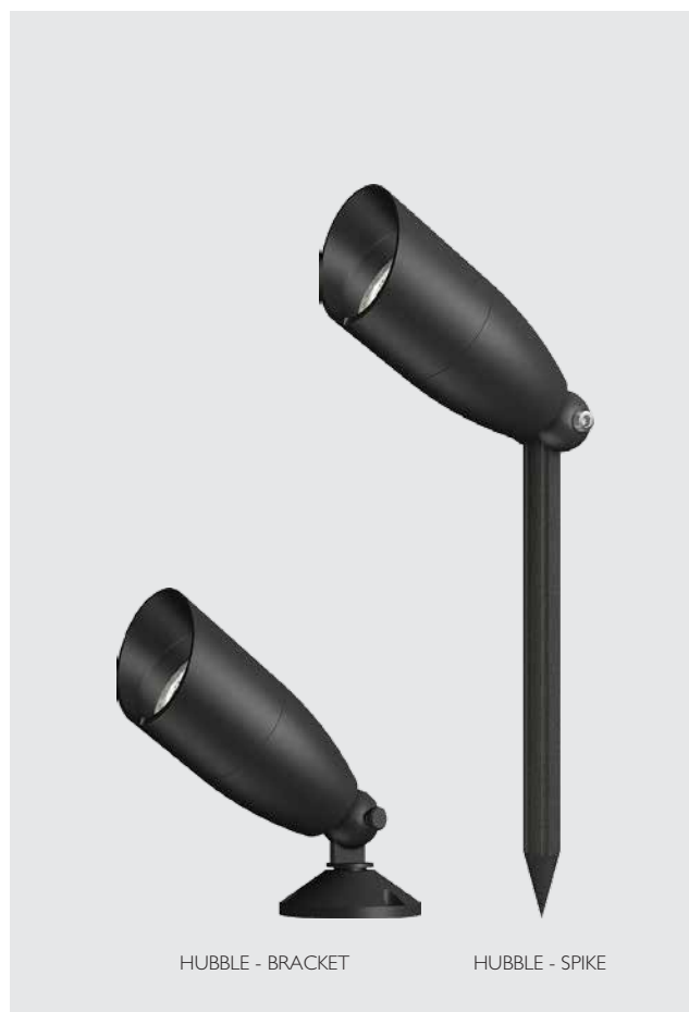
HUBBLE - BRACKET