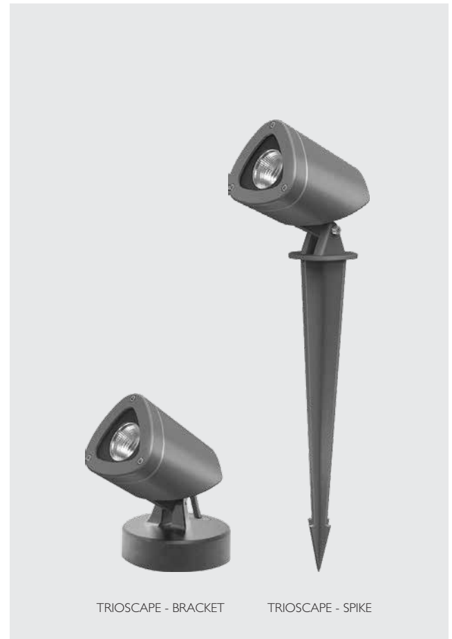
TRIOSCAPE - BRACKET

Pure polyester powder coated Graphite grey only.