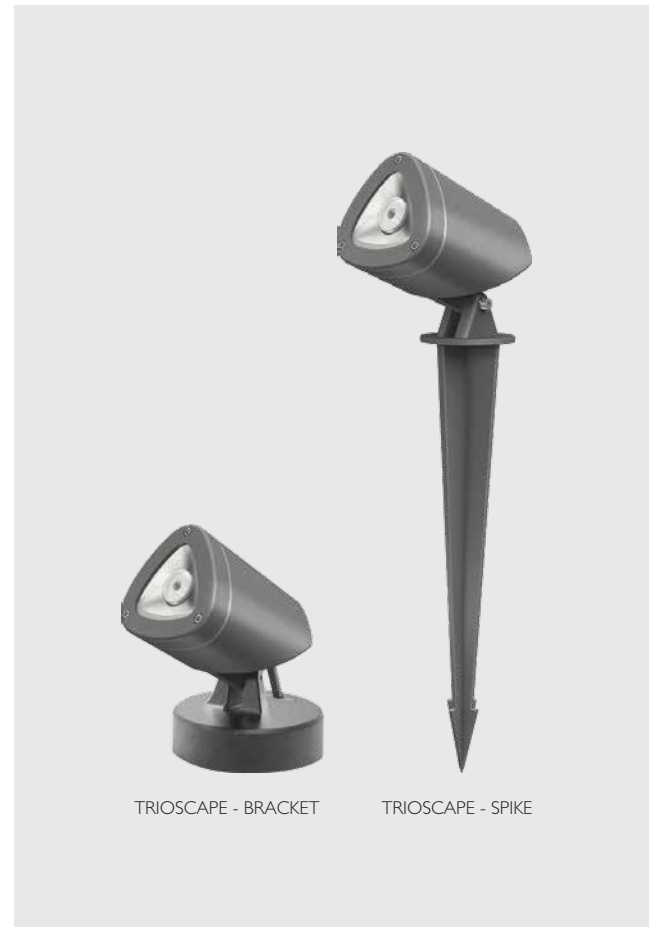
TRIOSCAPE - BRACKET

Pure polyester powder coated Graphite grey only.