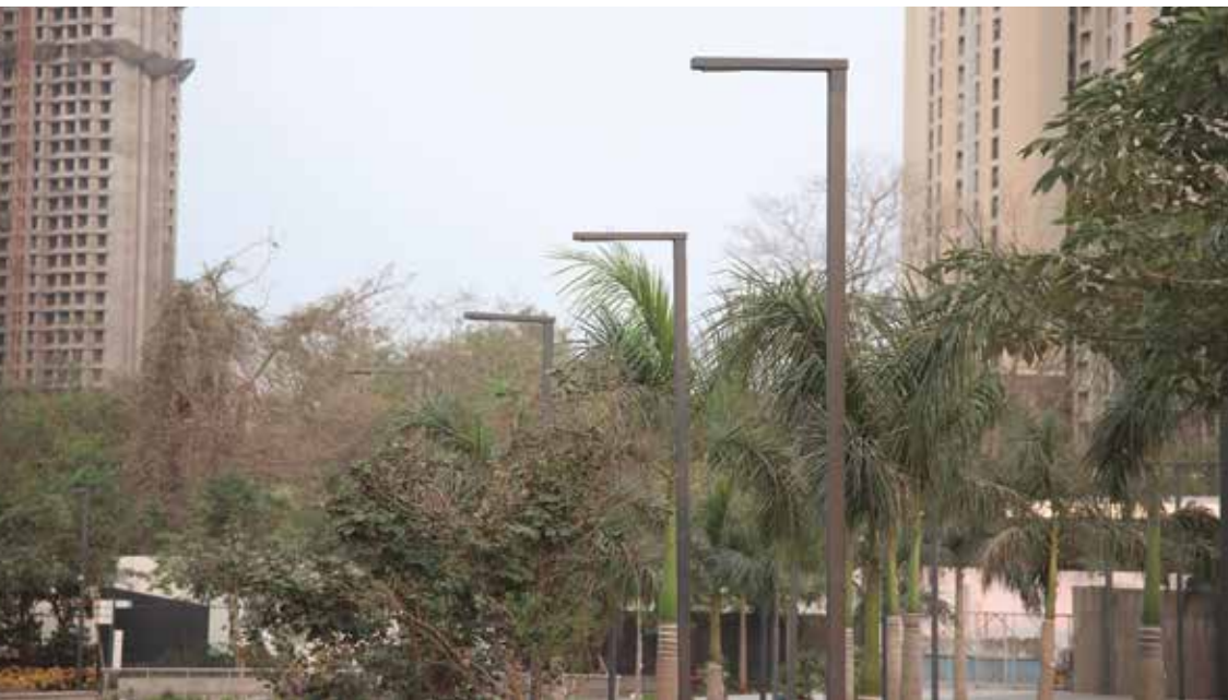
NAMO GRAND CENTRAL PARK, THANE