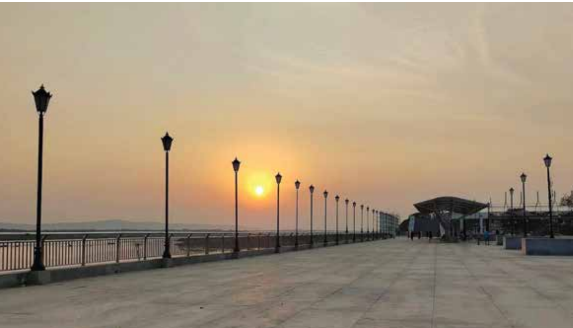
MAA SAMALESWARI TEMPLE, ODISHA